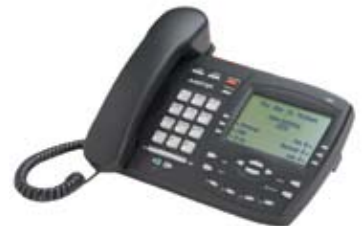
IPitomy 55i with 2 536m optional add on modules