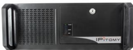
IP5000 - Pure IP PBX

Go to IPitomy.com for more details and a complete list of features.